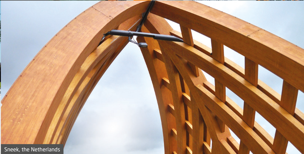
Sneek, the Netherlands