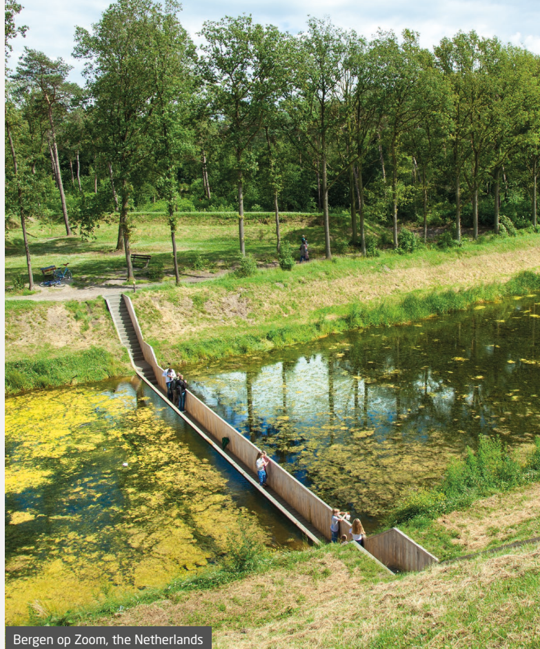
Bergen op Zoom, the Netherlands

Imagine a wood that can replace increasingly scarce tropical hardwoods, treated woods and less sustainable materials in new and existing outdoor applications. Imagine a wood that will act as a better carbon sink during its extended life span and can be safely recycled at the end. Such a wood exists. It is Accoya®: the world's leading high technology wood.